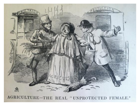
Fig. 2 'The Real Unprotected Female'

Also concerned with examining the state of the English farming body affected by the Repeal, GCAG and Farmer's Magazine employed a patriotic rhetoric that stresses the common corporeality and destiny of tenant-farmers, asserting that the condition of 'the agricultural body' affects 'our national, no less than our individual, welfare'. Yet, they maintain a neutral tone in acknowledging British agriculture and the tenant-farmer as the nation's body to be preserved. Whilst they understand that protectionists 'desire the national defence' through the Corn Laws and encourage 'any attempt to rouse the spirit of the people in patriotic self-defence', they also