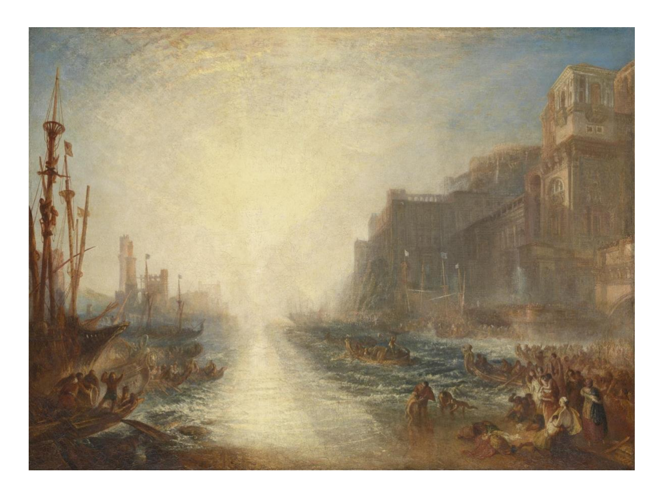
Fig. 7: Joseph Mallord William Turner, Regulus , 1828 reworked 1837, oil paint on canvas, support: 895 \times 1238 mm, frame: 1135 \times 1460 \times 93 mm, © Tate Britain, London, Photo © Tate, CC-BY-NC-ND 3.0

<a href="https://www.tate.org.uk/art/artworks/turner-regulus-n00519">https://www.tate.org.uk/art/artworks/turner-regulus-n00519</a>