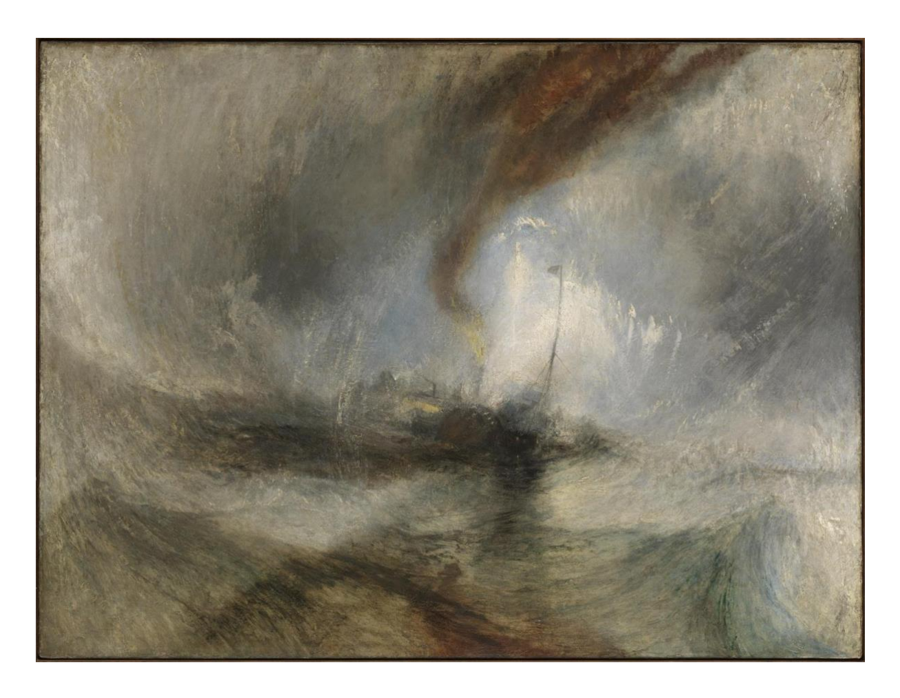
Fig. 6: Joseph Mallord William Turner, Snow Storm – Steam-Boat off a Harbour's Mouth , exhibited 1842, oil paint on canvas, support: 914 \times 1219 mm, frame: 1233 \times 1535 \times 145 mm, © Tate Britain, London, Photo © Tate, CC-BY-NC-ND 3.0

< https://www.tate.org.uk/art/artworks/turner-snow-storm-steam-boat-off-a-harbours-mouth-n00530>