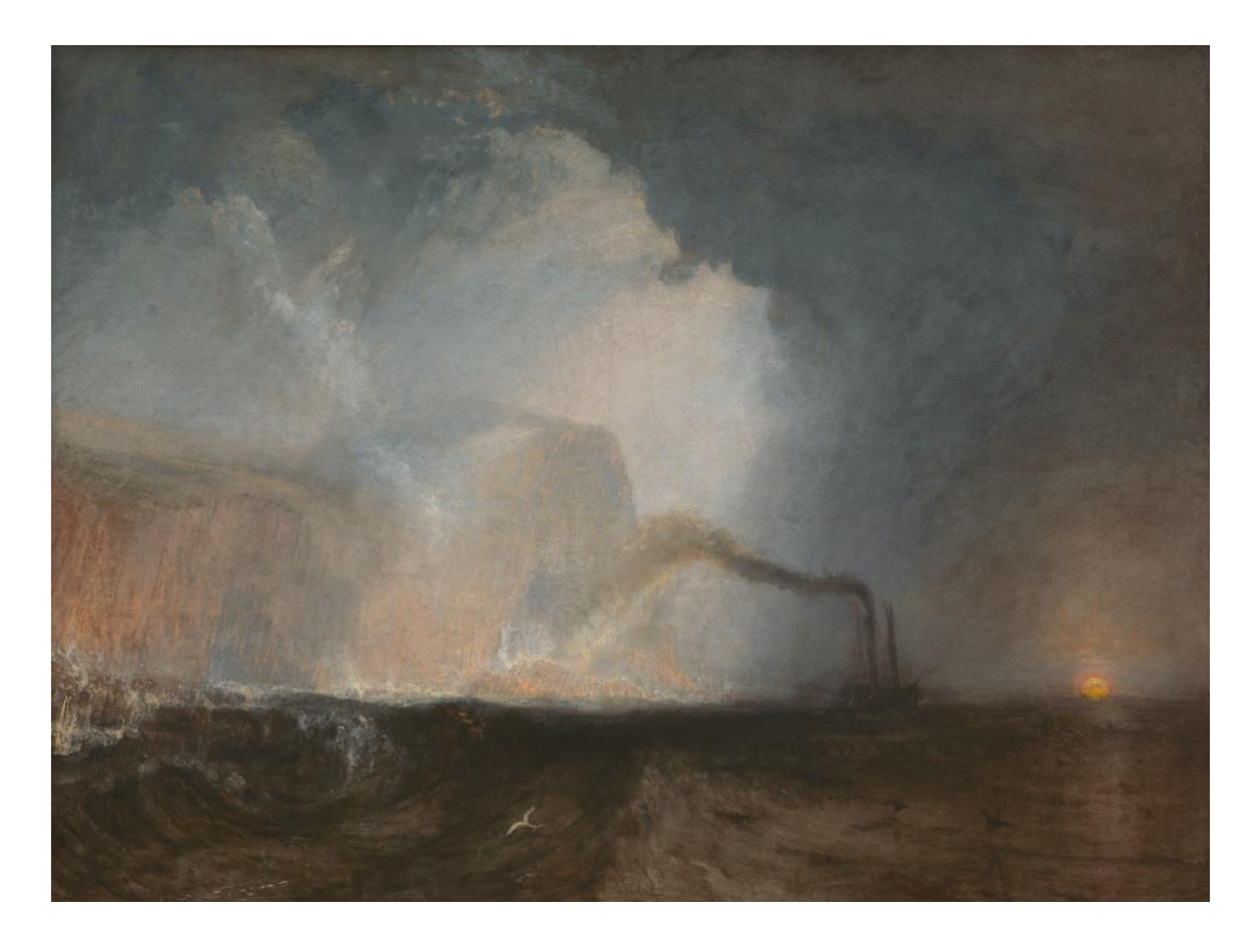
Fig. 2: Joseph Mallord William Turner, Staffa, Fingal's Cave , ca. 1831–32, oil on canvas, Yale Center for British Art, New Haven.

< https://collections.britishart.yale.edu/catalog/tms:5018 >