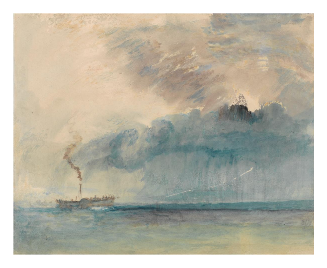
Fig 1: Joseph Mallord William Turner, A Paddle-steamer in a Storm , ca. 1841, Watercolor, graphite and scratching out on medium, slightly textured, cream wove paper, Yale Center for British Art, New Haven.