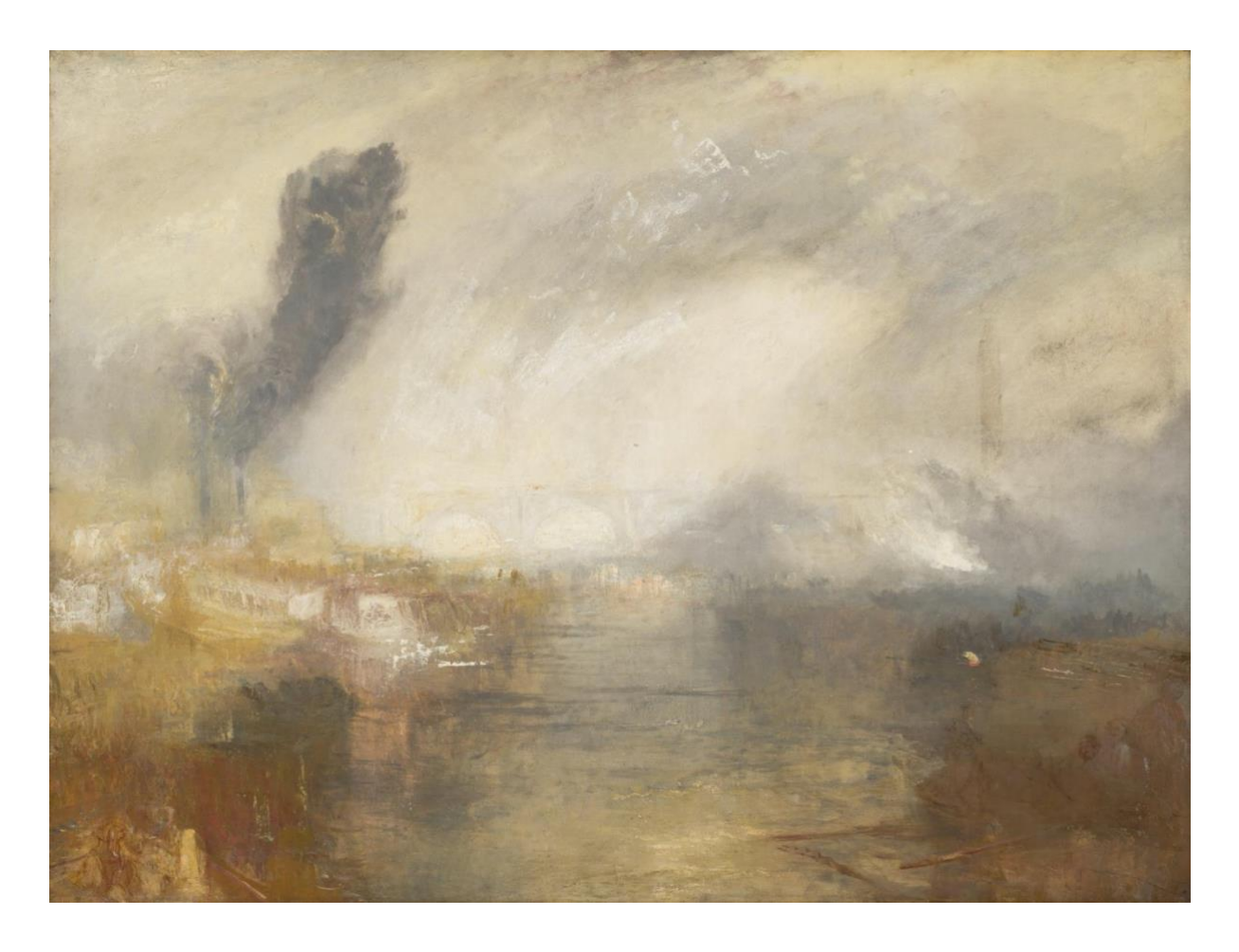
Fig. 5: Joseph Mallord William Turner, The Thames above Waterloo Bridge , c.1830 –5, oil paint on canvas, support: 905 \times 1210 mm, frame: 1138 \times 1457 \times 82 mm, © Tate Britain, London, Photo © Tate, CC-BY-NC-ND 3.0

<a href="https://www.tate.org.uk/art/artworks/turner-the-thames-above-waterloobridge-n01992">https://www.tate.org.uk/art/artworks/turner-the-thames-above-waterloobridge-n01992>