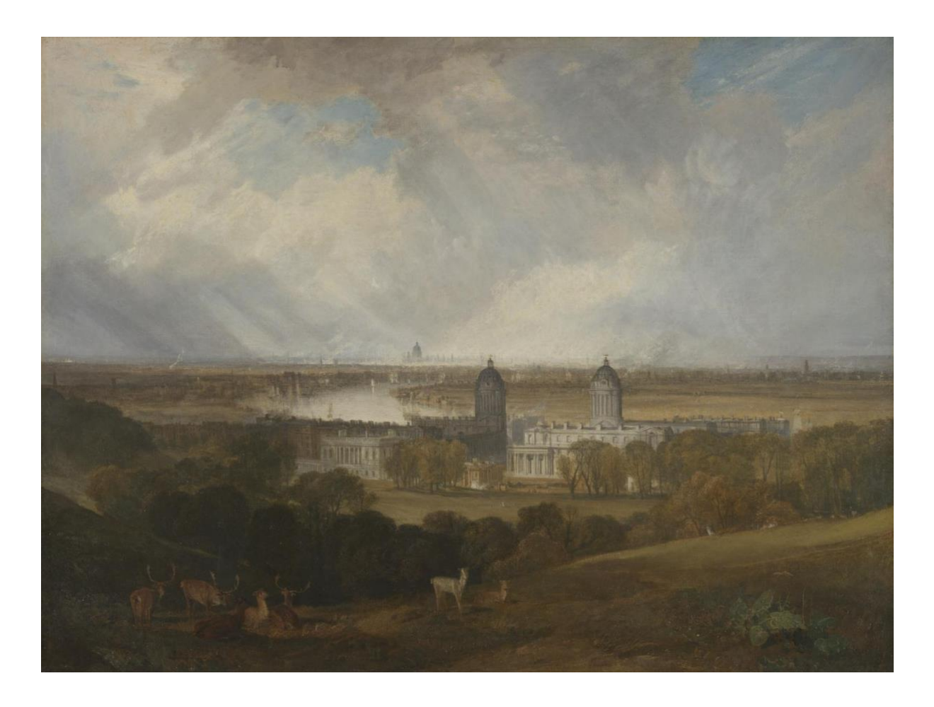
Fig. 3: Joseph Mallord William Turner, London from Greenwich Park , oil paint on canvas, support: 902 \times 1200 mm, frame: 1285 \times 1584 \times 155 mm, © Tate Britain, London, Photo © Tate, CC-BY-NC-ND 3.0

< https://www.tate.org.uk/art/artworks/turner-london-from-greenwich-park-n00483>