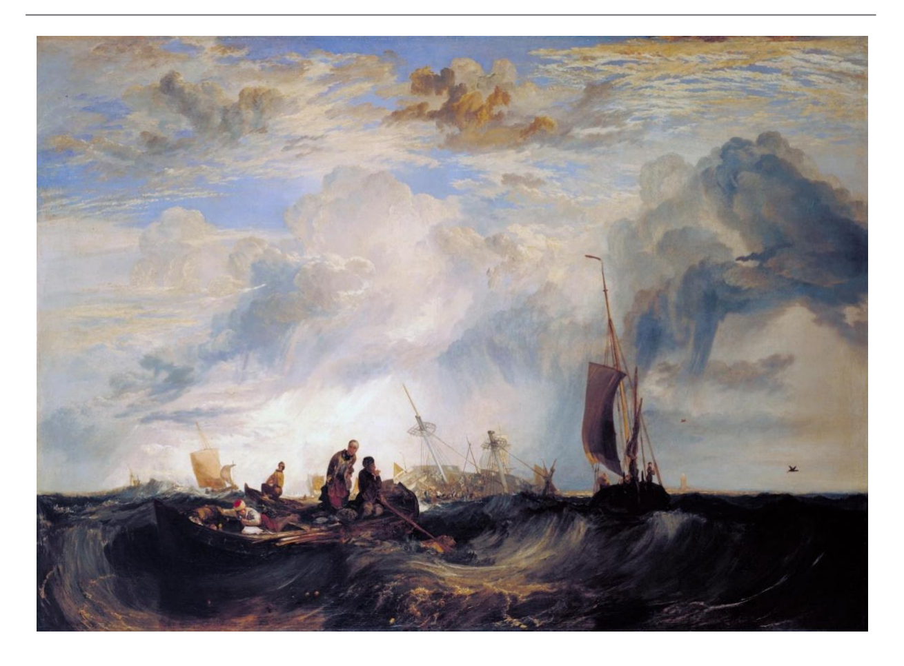
Fig. 4: Joseph Mallord William Turner, Entrance of the Meuse: Orange-Merchant on the Bar, Going to Pieces; Brill Church bearing S. E. by S., Masensluys E. by S. , exhibited 1819, oil paint on canvas, support: 1753 \times 2464 mm, frame: 2110 \times 2820 \times 140 mm, © Tate Britain, London, Photo © Tate, CC-BY-NC-ND 3.0

< https://www.tate.org.uk/art/artworks/turner-entrance-of-the-meuse-orange-merchant-on-the-bar-going-to-pieces-brill-church-n00501>